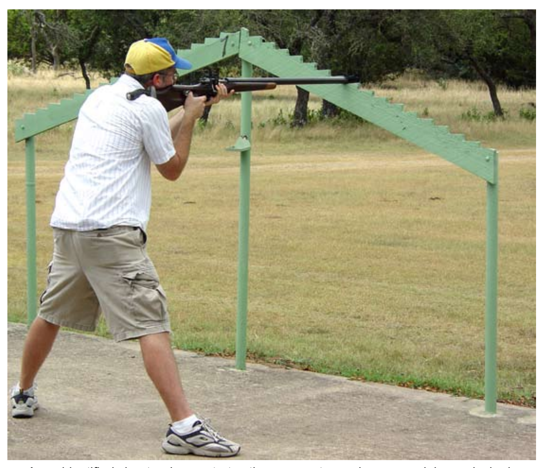
An unidentified shooter demonstrates the proper stance: legs spread, knees locked, leaning into the rifle, to make the steadiest position possible, driving a bullet 200 yards using open sights to hit a bulls-eye about 3" in diameter.