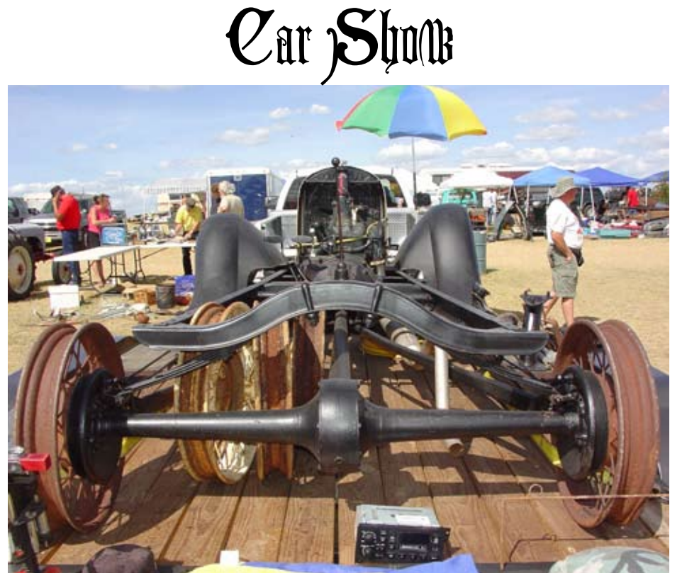
This is a 1929 Model A. The seller was asking $3500. He said he was keeping the body, having already put $7000 into it.