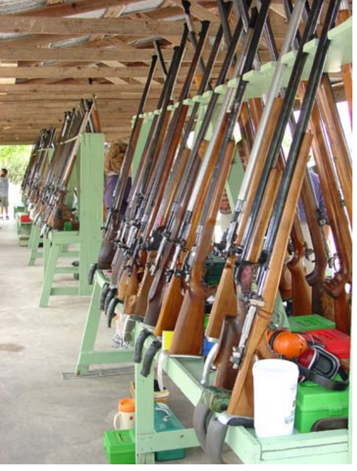
Row upon Row of the some of the most accurate rifles in the area. The guns must meet various requirements to be entered in the contest. The rear sight must have a slit that is not too narrow, or not closed, which would make it a peep sight; the front sight must be a post, not a ball. The front post is blackened with a sooty flame.