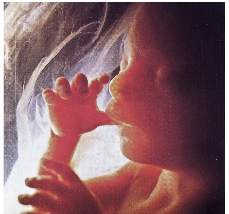
Thou shalt not kill. Exodus 20:13 Whoso sheddeth man's blood, by man shall his blood be shed: for in the image of God made he man. Genesis 9:6

Attorney General Ken Paxton issued an Advisory that explains it pretty well: