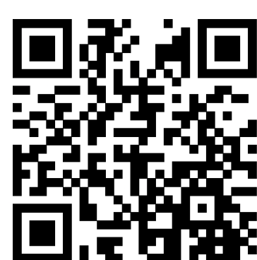
IndoctriNation Free Version

The rationale used by the Court to overturn Roe was to attack the concept of unenumerated rights. I believe the Court could have refrained from weakening the Ninth Amendment, while at the same time outlawing all abortions in all states, if they had attacked the concept of abortion directly.